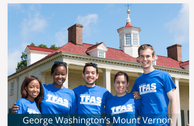
George Washington's Mount Vernon