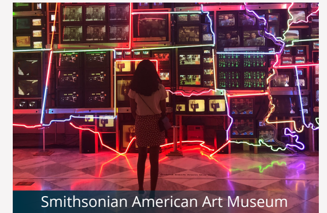
Smithsonian American Art Museum