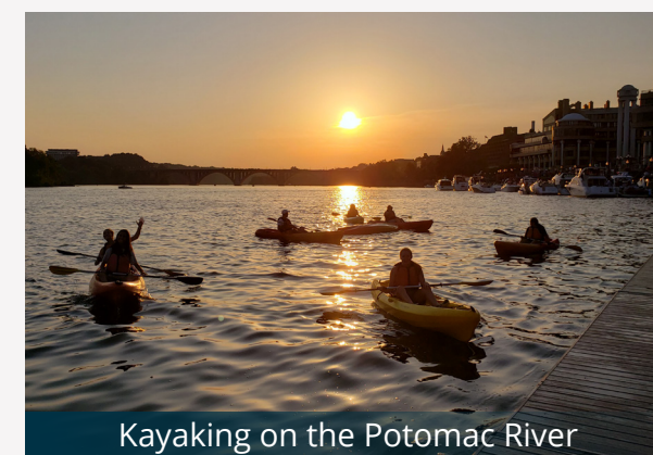
Kayaking on the Potomac River