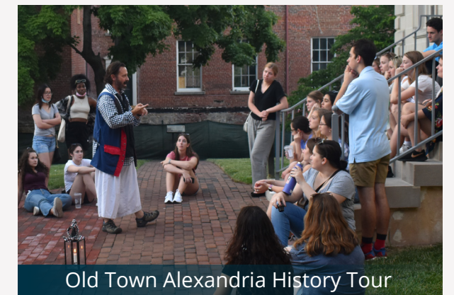
Old Town Alexandria History Tour