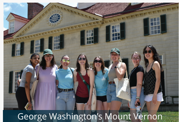
George Washington's Mount Vernon