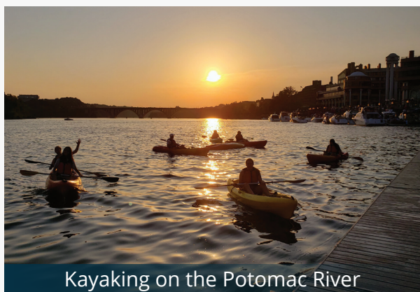
Kayaking on the Potomac River